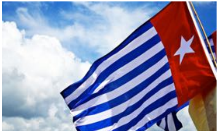
WEST PAPUAN FLAG

Write to the Australian government - local member, Senators, Foreign Minister, Prime Minister questioning our support of a counter-terrorism such as Detachment 88 which is used to manage peaceful political dissent.